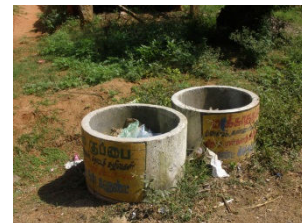
Hand in Hand's bins are useful in the collection of garbage.

One of the focus areas of the VUP is to create a clean and green environment in the village it works in. In Thuraiperumpakkam, the cleaning of the village is the responsibility that five SHGs share between them. Annammal, who is the leader of Roja SHG, motivates her group of 15 to do the cleaning up of the village