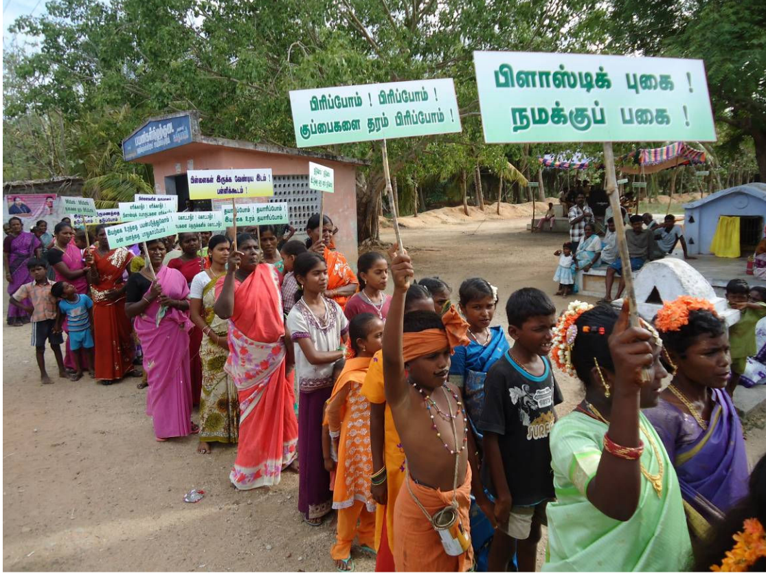
Environment Day Celebration in the village

Submitted to: Fastec Sverige AB Box 709 Skellefteå Sweden